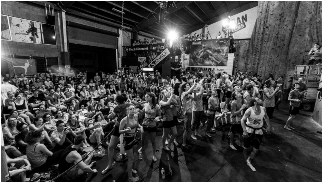
LeadFest & State Lead Titles 2015 at Urban Climb

Furthermore, there will be a number of local and interstate retailers setting up stalls. Word has it they will be having some insane special event deals on their products!